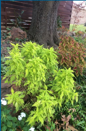
FALL MANOR COLOR EARLY WINTER 2021