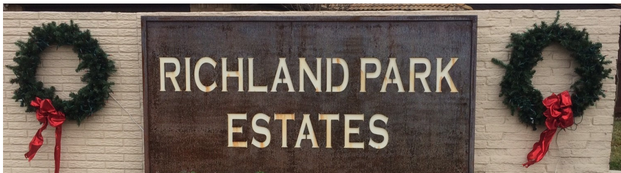
AUDELIA ENTRANCE DECEMBER 2021